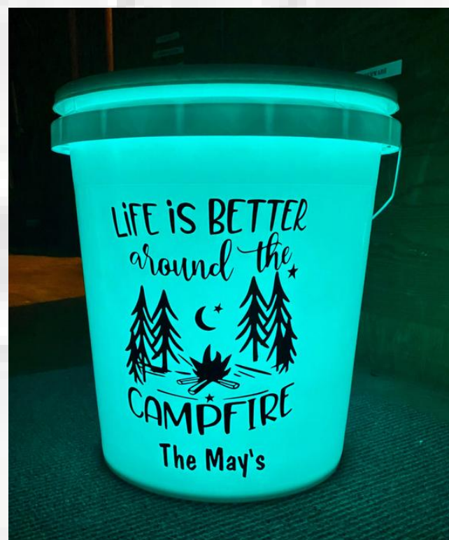
Glow Bucket Tee Sign Example